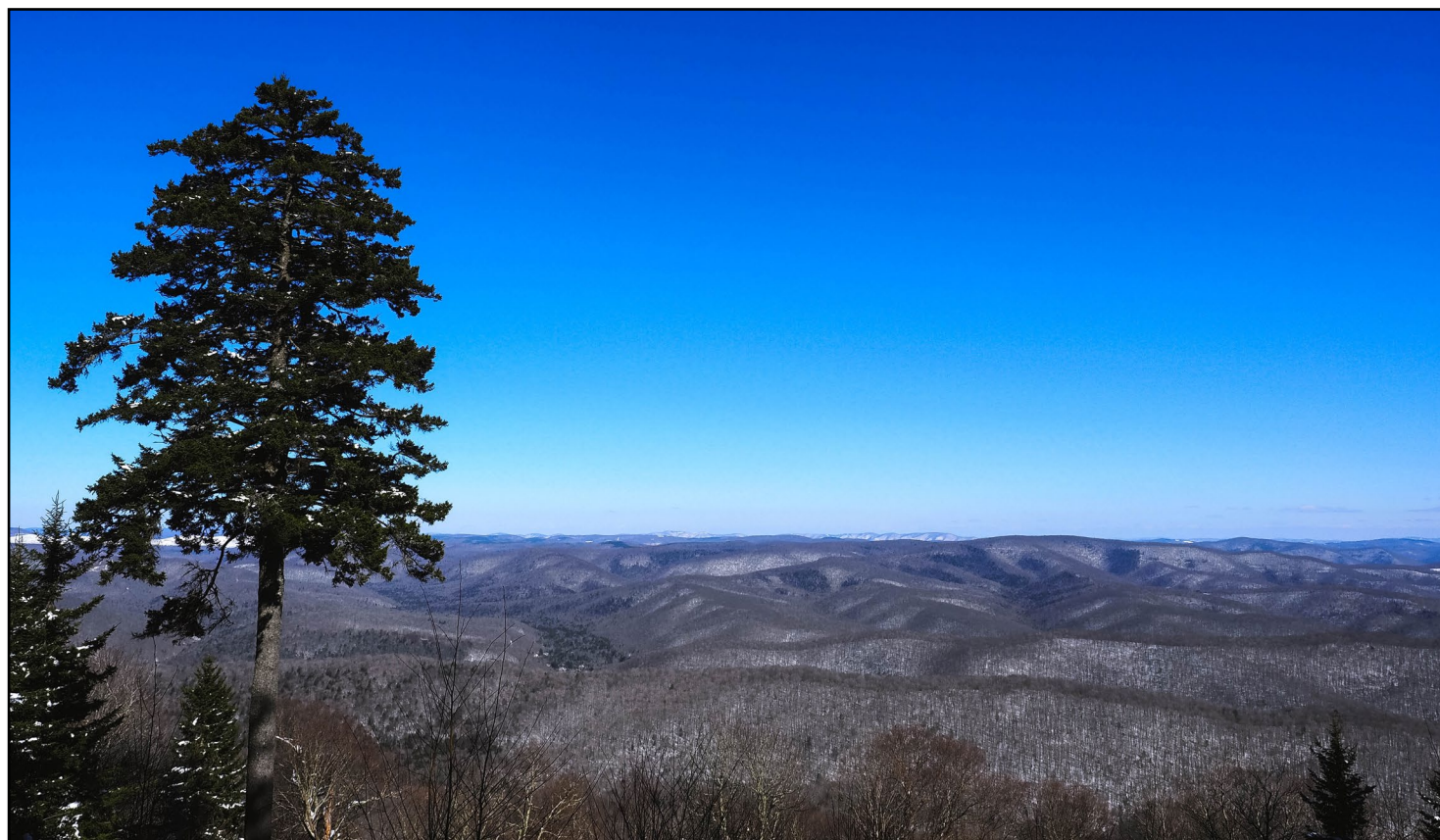
Gaudineer Knob in the Monongahela National Forest.

As a preliminary step for this analysis, The Nature Conservancy (TNC) convened a Red Spruce Technical Advisory Board (RSTAB) to provide expert and science-informed technical recommendations on red spruce ecosystem restoration methods and impacts. The RSTAB included partici-