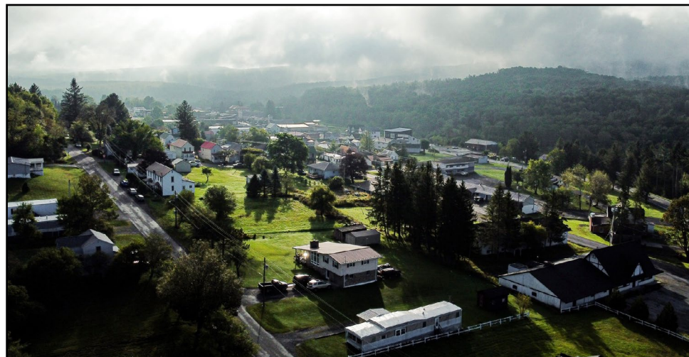
An aerial view of Davis, WV.

In a letter addressed to U.S. Department of Transportation Secretary Pete Buttigieg, the business owners expressed their deep concerns about the currently recommended southern alignment (ROPA) for the 10-mile stretch of Corridor H between Parsons