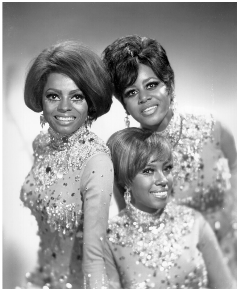
The Supremes prepare for their deliberations.