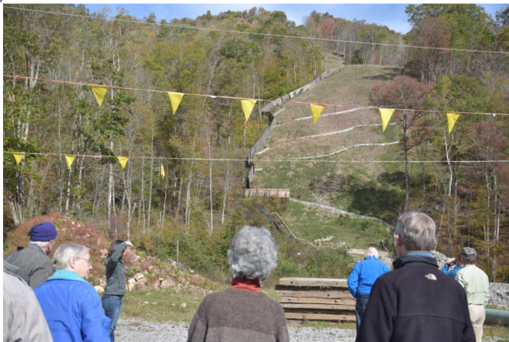
WVHC tour of part of pipeline route

At the same time, it's steep. Too steep to comfortably walk up without zigzagging. Steep enough to require extraordinary measures to keep slopes in place. Steep enough that when one sees the route the only reasonable reaction is "Darn, that's steep!"