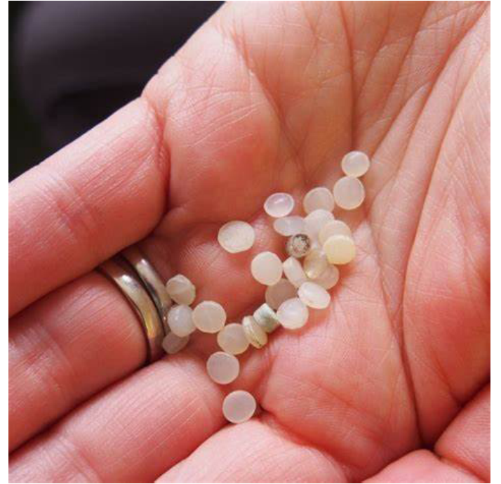
A handful of nurdles