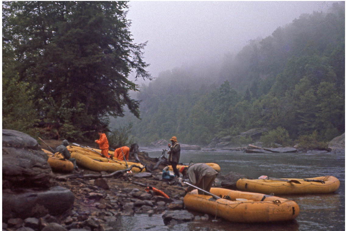
First Launch

We put in at Route 39 east of Summersville. We hit the first interesting water (now under the lake) at the old Route 19