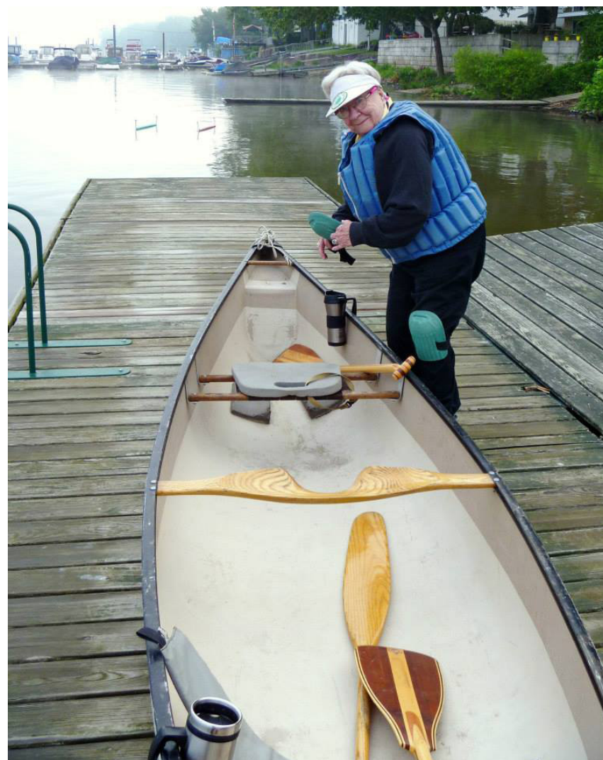
Ready for the next adventure

A celebration of Jean's life will be planned for a later date.