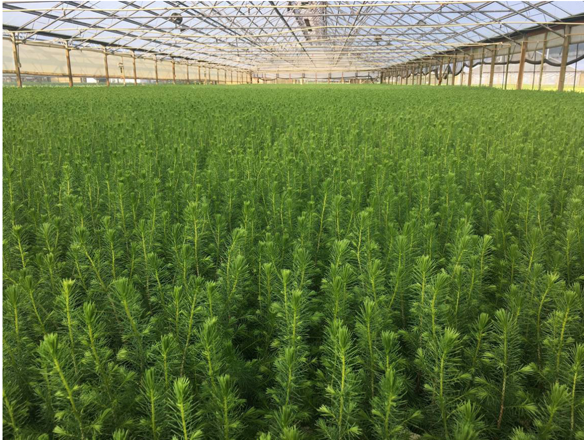
The red spruce trees pictured here are being grown from seeds collected at Spruce Knob, West Virginia. They will be planted back in the West Virginia Highlands in Spring 2019.