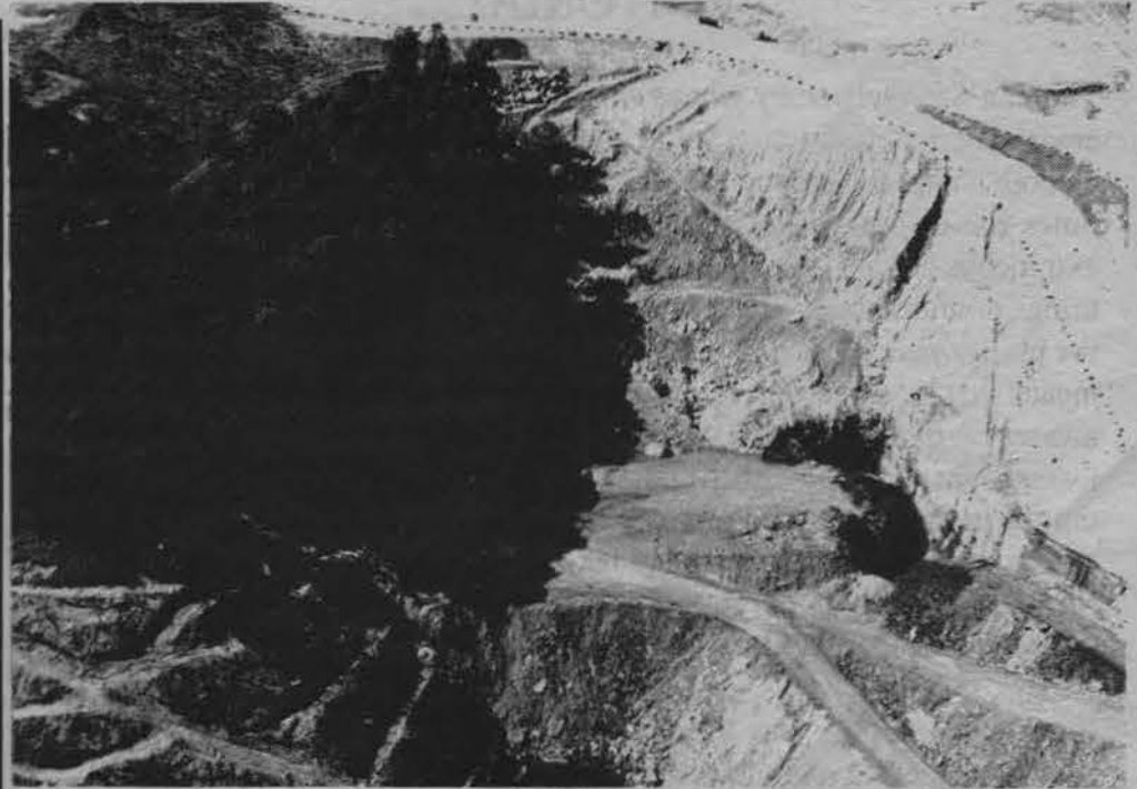
A STRIP MINE ON CAMPBELL'S CREEK IN KANAWHA COUNTY.

The SMCRA was enacted because of the public sentiment and political pressure that grew out of the outrage of the Buffalo Creek disaster. The governmental powers have failed to give more than lip service to SMCRA during the past three administrations. What other major disaster is required to galvanize the public into demanding that the US Congress to show more than token recognition to the citizens who live around strip mines? How many more must die to bring home the necessary concern so that the proper attention to the enforcement of SMCRA by the Clinton and future administrations be given?