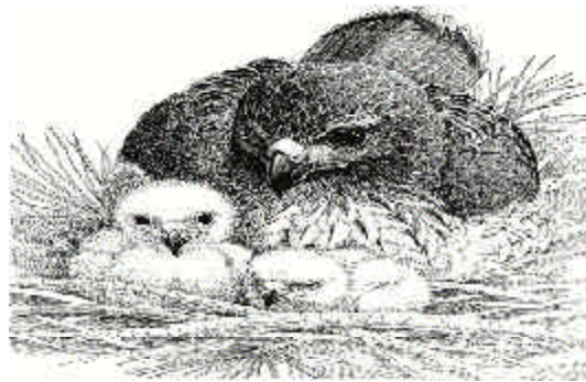
Happy Mothers Day!