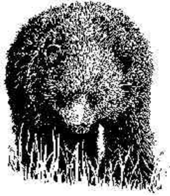
U. S. Fish and Wildlife Service/Bob Savannah

the Forest Service to check on their recovery. We were pleased to find them regenerating quite nicely with a variety of native species (definitely not tree farms!) It was also