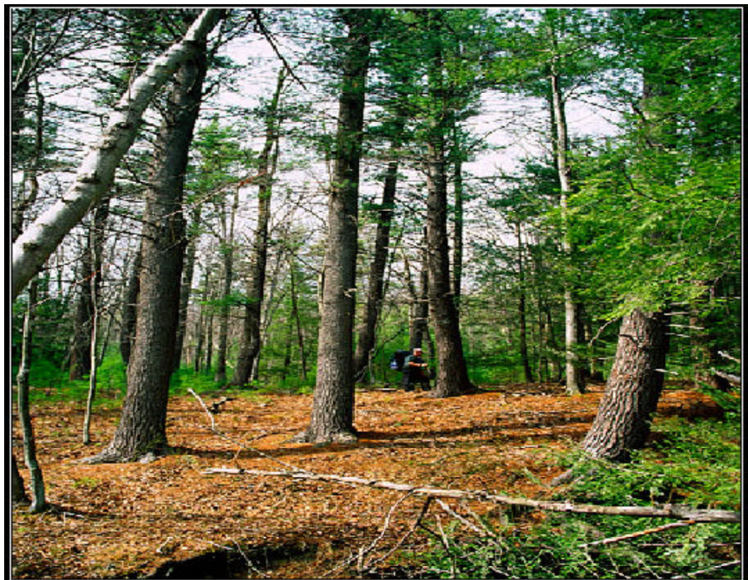
Wilson Cove, WV Old Growth Forest