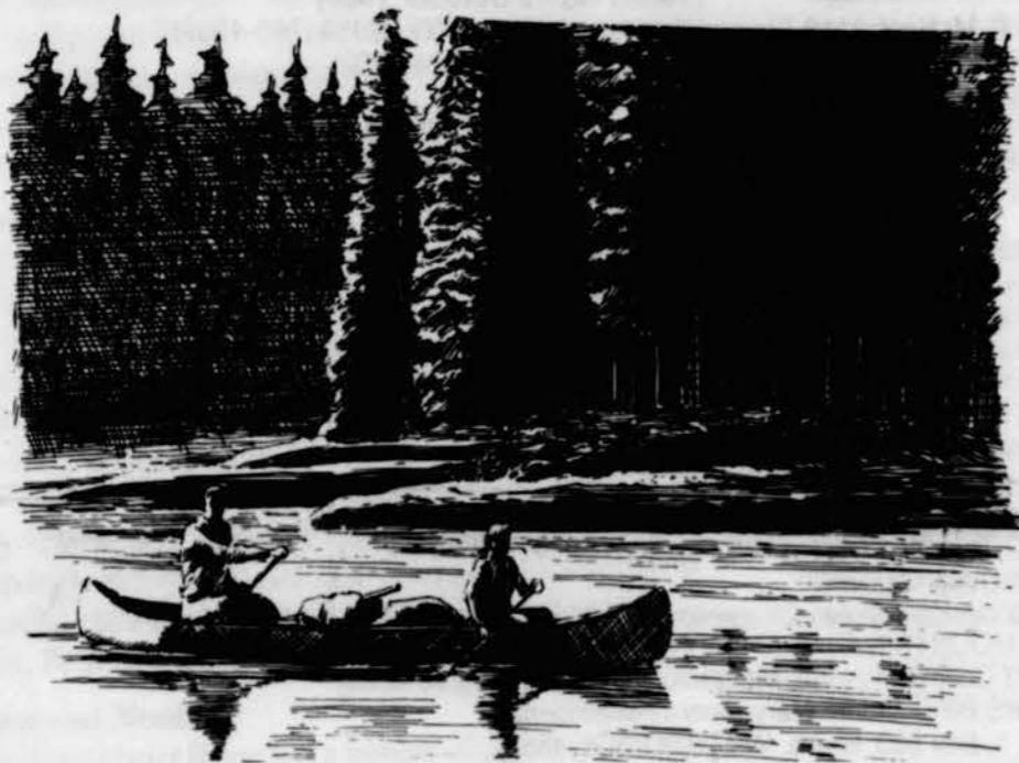
(details on page 8)