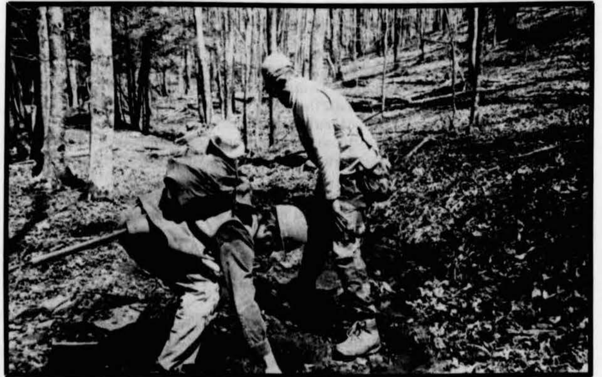
Conservancy members help construct a water bar on a trail in the Laurel Fork Wilderness during the Spring Review weekend. Their efforts were part of the Sierra Club's cooperative trail recovery project in the Monongahela National Forest.

Join today and become part of an active organization dedicated to preserving West Virginia's natural resources.