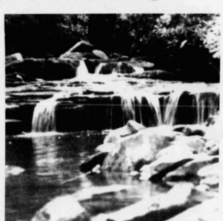
Waterfall near the mouth of Devil's Gulch in the Otter Creek Wilderness.

After a short distance, we left the Otter Creek Trail and began a 1-mile ascent on Big Springs Gap Trail, the Cheat Ranger District's preferred north access route to the Otter Creek Trail. We followed a rocky drain where the stream appeared and disappeared on its subterranean route.