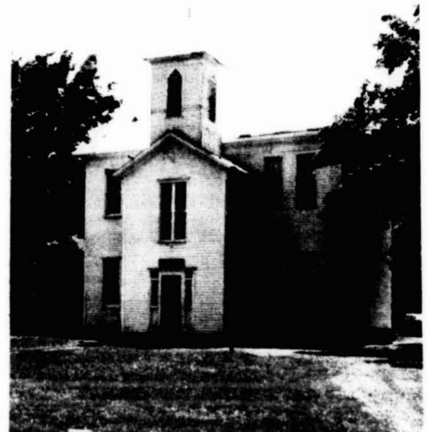
The Saint George Academy, built in 1886.