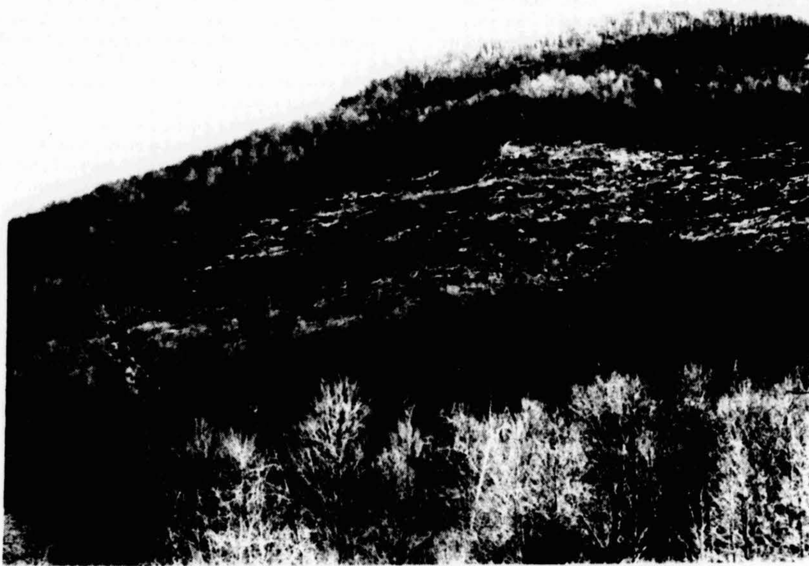
At the heart of the timber bill controversy is who shall decide management policies on the National Forests - foresters, politicians, or people who use the forests for recreation?

Hearings were held last week before a joint session of the House Interior and Agriculture committees on the controversial bills to revise the U.S. Forest Service's Organic Act of 1897. The impetus for the hearings came as a result of recent legal decisions, including the famous Monongahela case, won by environmentalists, in which the courts held that the Organic Act prevented certain forms of clearcutting and other forest practices. The timber industry is making an all-out effort to reverse the decision and to let the Forest Service return to past practices, many of them extremely damaging to wildlife, recreation, and wilderness. Senator Hubert Humphrey (D-Minn.) is the lead sponsor of their bill S.3091, whose key section simply reverses the Monongahela decision. At the hearings, most industry witnesses and their allies supported the Humphrey bill. Environmentalists, also strongly represented at the hearings, favored S. 2926, the National Forest Reform Act, sponsored by Senator Jennings Randolph (D-WV), which sets minimum standards for certain practices. For example, it