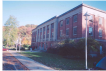
Iron Horse (next to City Park)